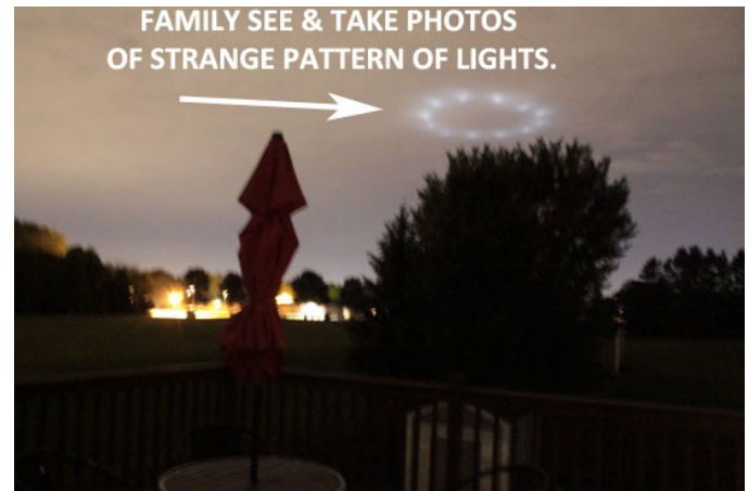
1 of 3 PHOTOS TAKEN OF CIRCULAR BAND OF LIGHTS SEEN BY FAMILY.

Description: We saw lights of perfect circular shape. They were very bright lights above the thick clouds. They remained stationary for a few minutes (about 10 minutes) and then disappeared. My whole family saw this phenomenon. We live in a very quiet area. There were no lights beamed from below. It wasn't moving in the air like a kite with lights.